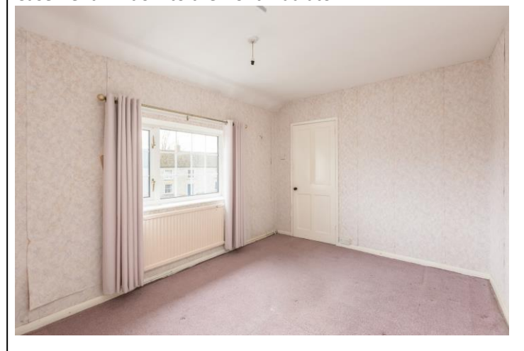
BEDROOM TWO 3.80 m (12'6") x 3.00 m (9'10") Casement window to the front. Radiator.

3.35 m (11'0") x 3.00 m (9'10") Casement window to the front. Radiator.