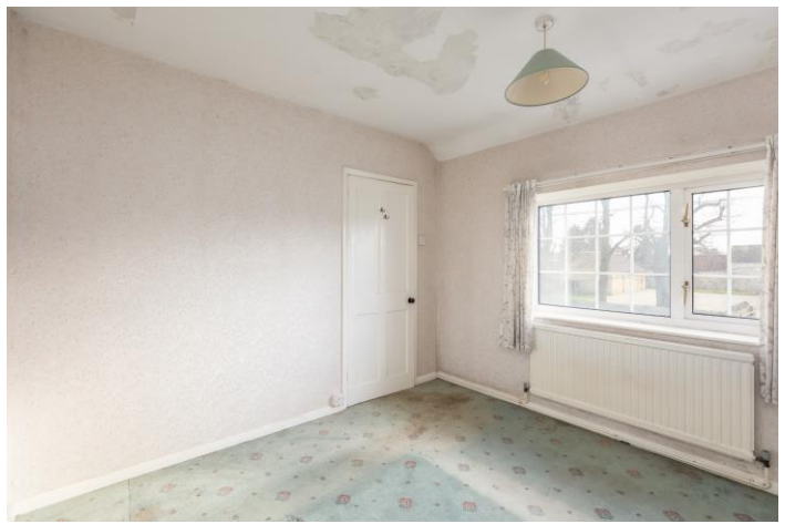
BEDROOM THREE 3.80 m (12'6") x 1.80 m (5'11") Casement window to the rear. Radiator. Fitted cupboard. Wood floorboards.